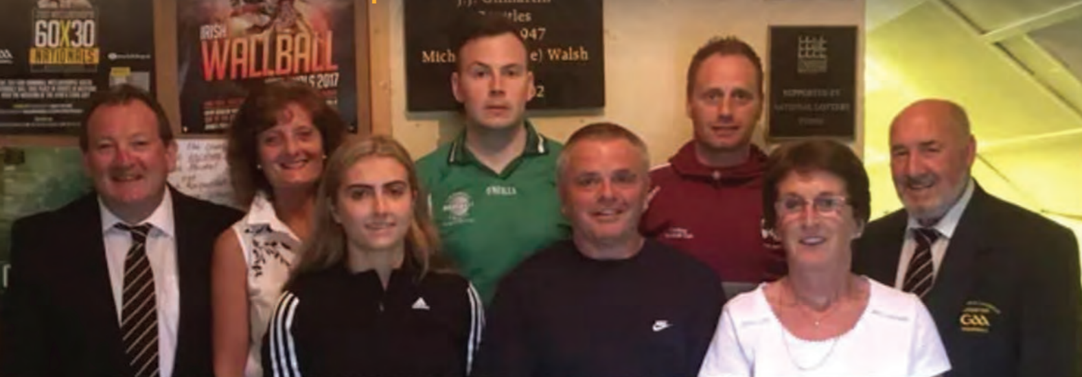
Members of the Talbot's Inch Handball Club Organising Committee pictured at the tournament

The organising committee at Talbot's Inch Handball Club provided a great day of entertainment in handball, which was a fitting tribute to a true legend.