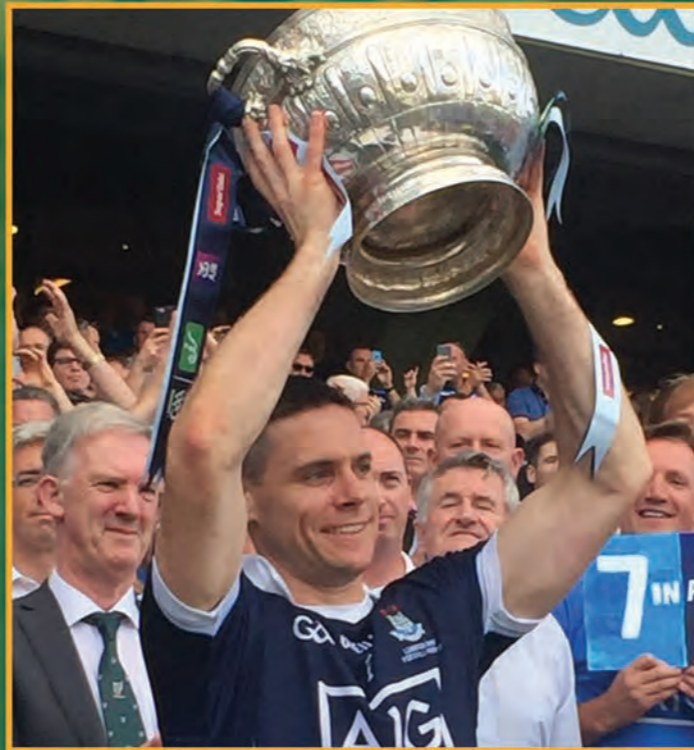
Captain Stephen Cluxton raises the Delaney Cup as Dublin clinch their seventh Leinster Senior Football title in succession.

This year, 56 teams from 11 of the 12 Leinster counties participated in the Leinster Adult Club Hurling League, split into four divisions and just shy of 100 games were played.