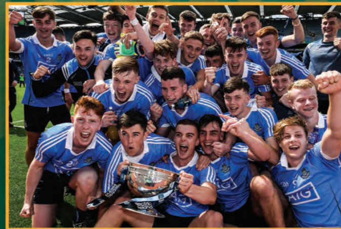
Dublin - Electric Ireland Leinster Minor Football Champions 2017