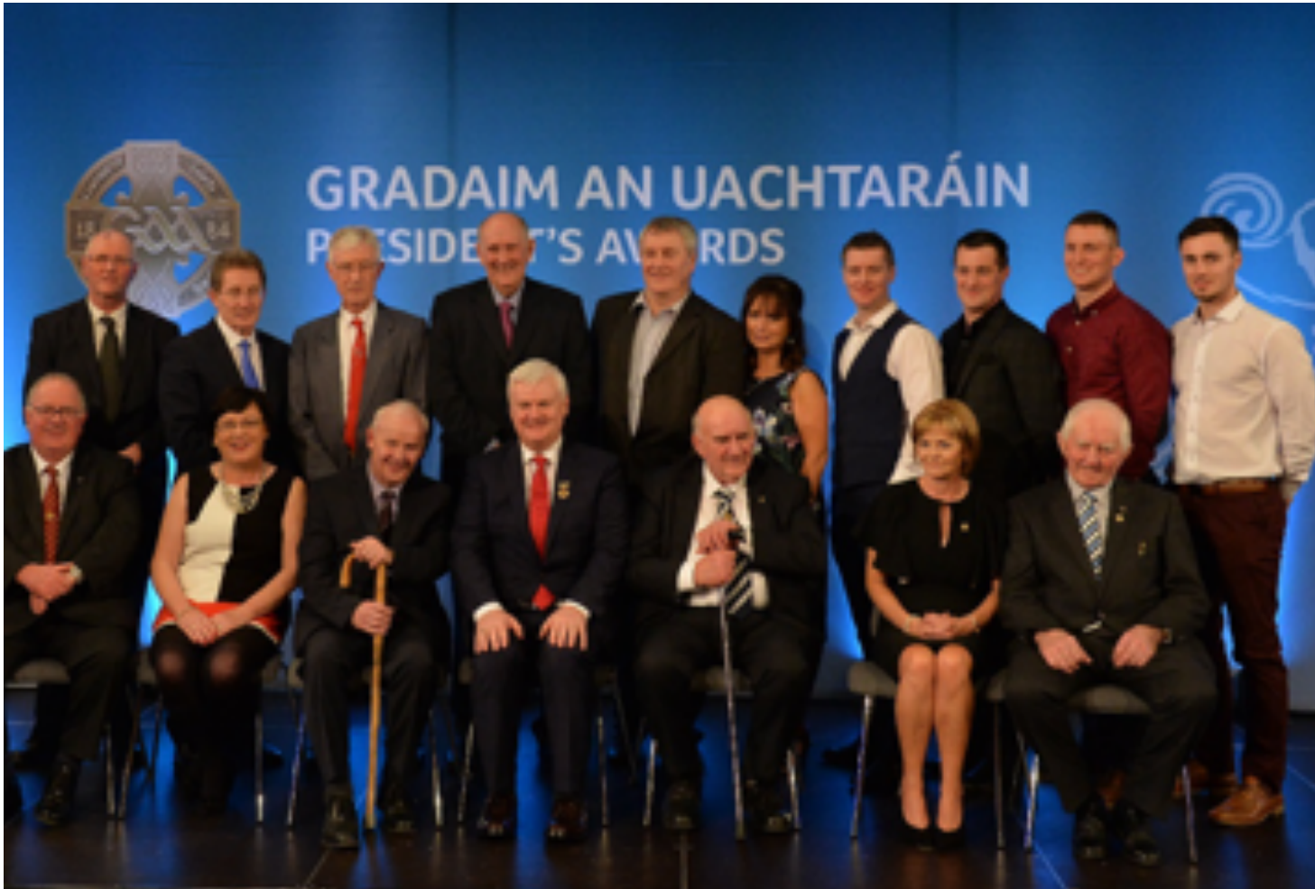
Winners of GAA President's Awards 2017 in Croke Park

T he GAA is pleased to confirm the recipients for Gradaim an Uachtaráin 2017 which were presented at a special banquet in Croke Park.